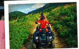
#Drive through rough roads!