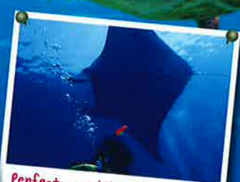
Perfect conditions for diving!