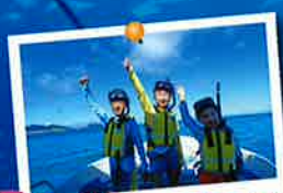
The most impressed No worries, even if you can't swim!