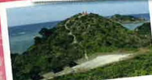
#Let's go up the hill with a great view!