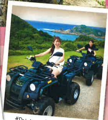
#Driving a baggy for the first time.

It's raining? Free use of rain suits is available.