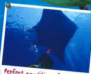
Perfect conditions for diving!