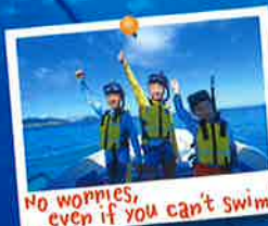
No worries, even if you can't swim!

*You can use diving/shorkeling equipment and warm wetsuits for free.