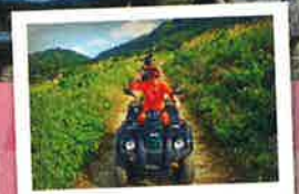
#Drive through rough roads!