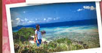
#Stop at a secret view point!